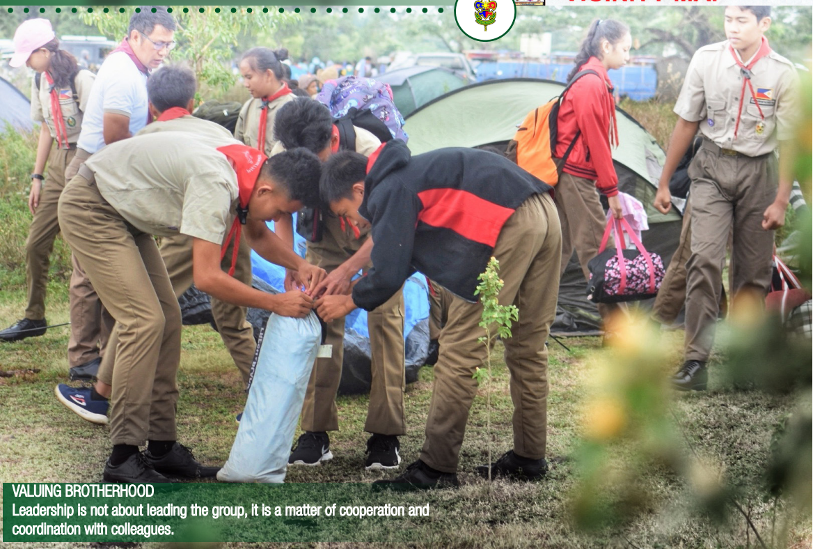
VALUING BROTHERHOOD Leadership is not about leading the group, it is a matter of cooperation and coordination with colleagues.