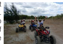
Top to Bottom: Crater of Mt. Pinatubo Tukul-tukul Falls ATV Ride (Camp Kainomayan)