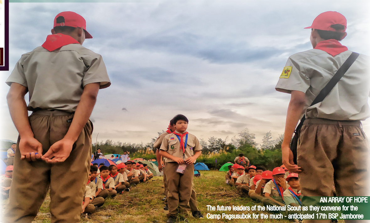
AN ARRAY OF HOPE The future leaders of the National Scout as they convene for the Camp Pagsusubok for the much - anticipated 17th BSP Jamboree