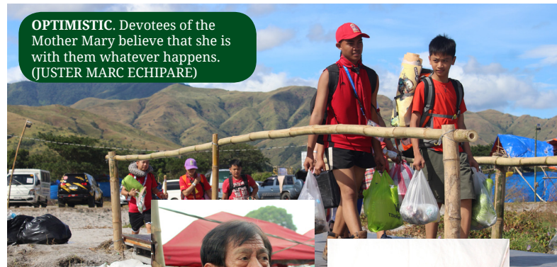
OPTIMISTIC. Devotees of the Mother Mary believe that she is with them whatever happens. (JUSTER MARC ECHIPARE)

safety they aspire, for Mary is with them, guiding and protecting, the same way it interceded for them in 1993 at Aurora, Quezon, when it was struck by big flood and landslide and flood.