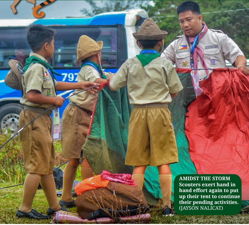
AMIDST THE STORM Scouters exert hand in hand effort again to put up their tent to continue their pending activities.

2019 EDITION ISSUE 4 | DECEMBER 05, 2019